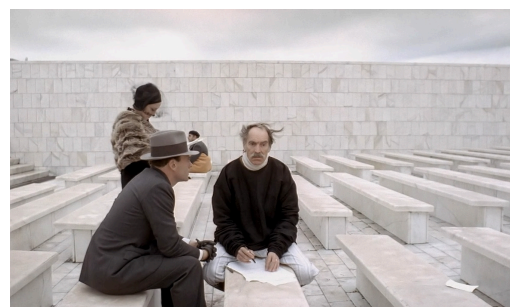
figure 5: Palazzo dei Congressi, Rome. Libera, 1938-54, scene from The Conformist , Bernardo Bertolucci, 1970.