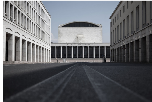
figure 2: Palazzo dei Congressi, Rome. Libera, 1938-54.