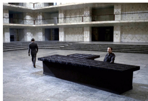
figure 4: Palazzo dei Congressi, Rome. Libera, 1938-54, scene from The Conformist , Bernardo Bertolucci, 1970.