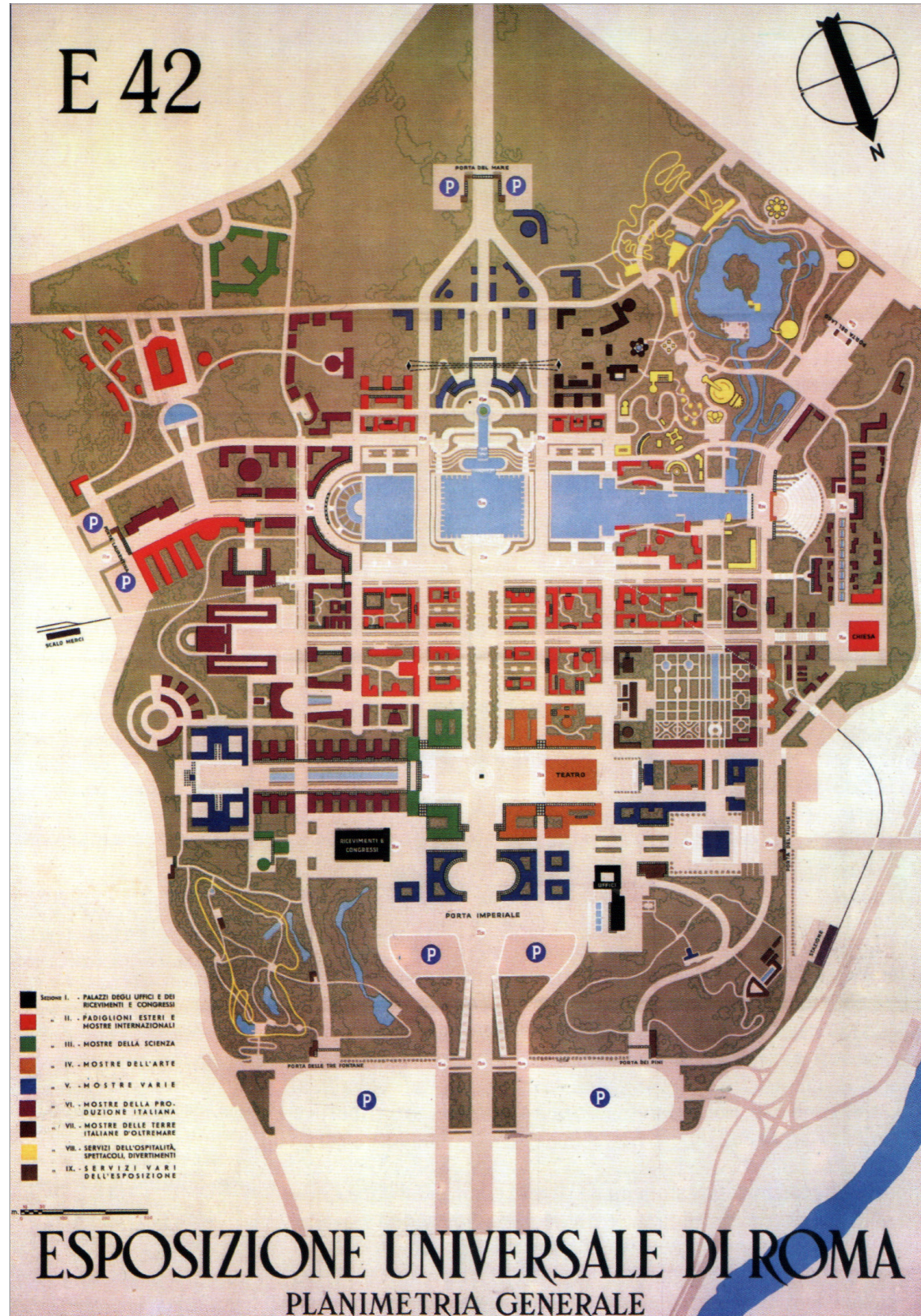
FIGURE 1: Esposizione Universale di Roma (EUR), original masterplan, Marcello Piacentini et al., 1937.

The course comprises a series of lectures and (hopefully) on-site visits to Modernist and Contemporary buildings, urban spaces, and architectural practices, combined with a semester-long precedent research project: students will document, draw & model an assigned building in Rome's EUR district, projects that span the site's urban history from the 1930s to the present day.