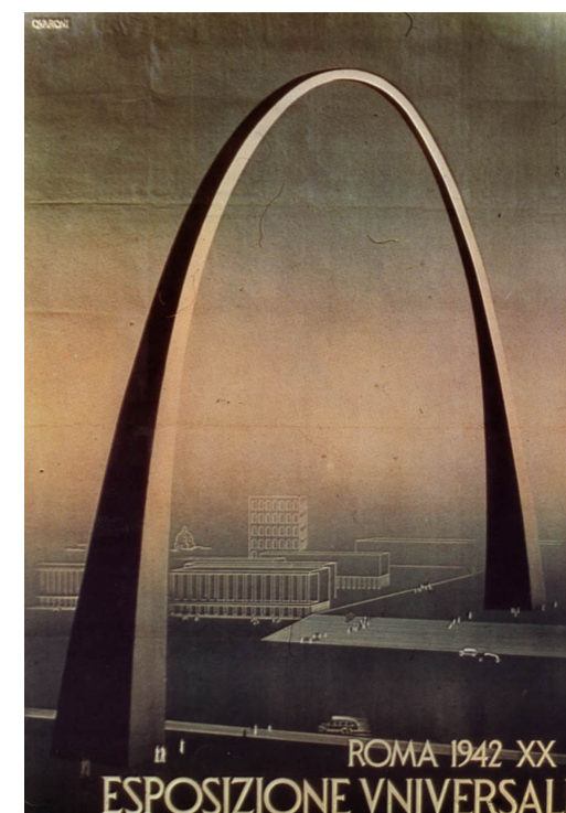
FIGURE 8: E42 Arch, Rome, Adalberto Libera, 1939