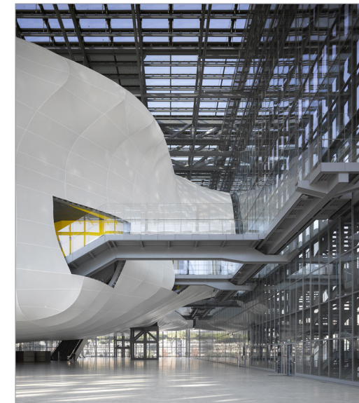
FIGURE 7: La Nuvola, EUR, Studio Fuksas, 2016