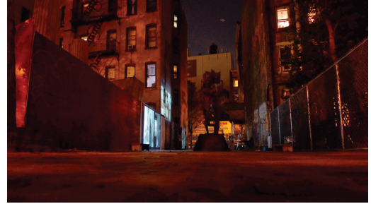
Urban Exquisite , media installation by instructor, New York City