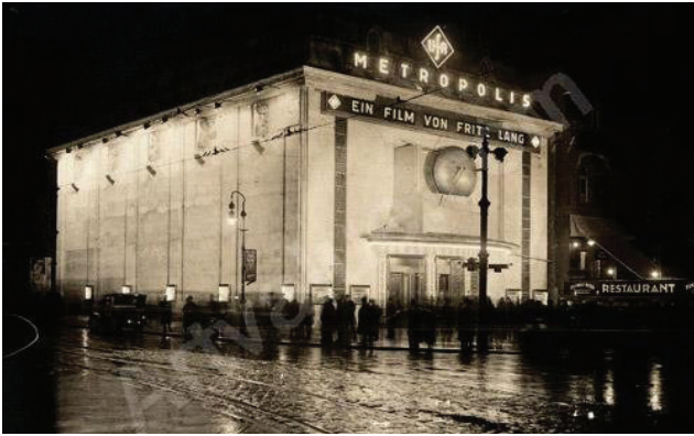
UFA film palaces in 1920s Berlin