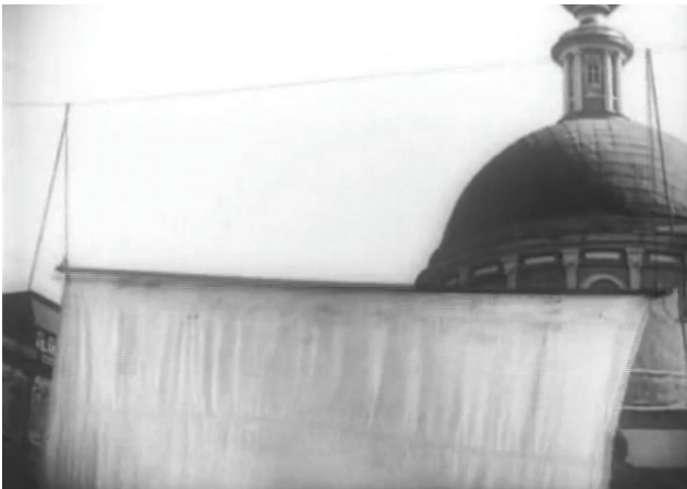
Portable cinema, Dziga Vertov