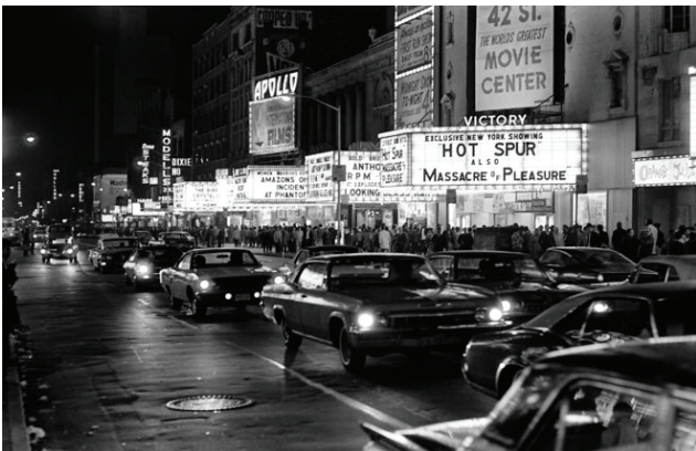
Times Square, New York City