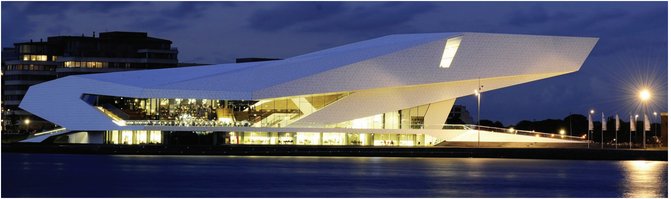
EYE Film Center, Amsterdam