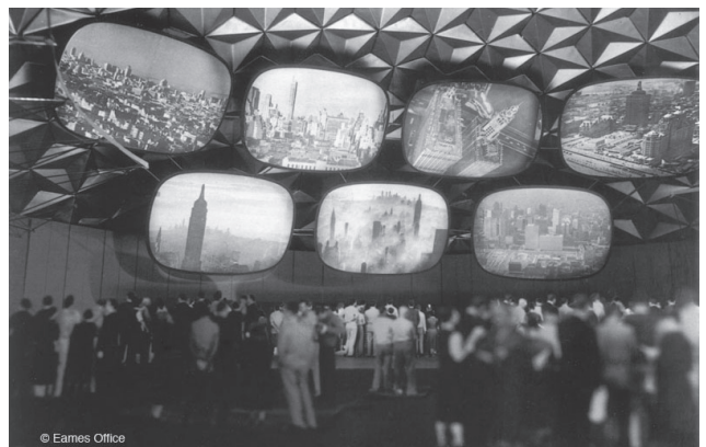
Glimpses of USA exhibition, The Eames Office