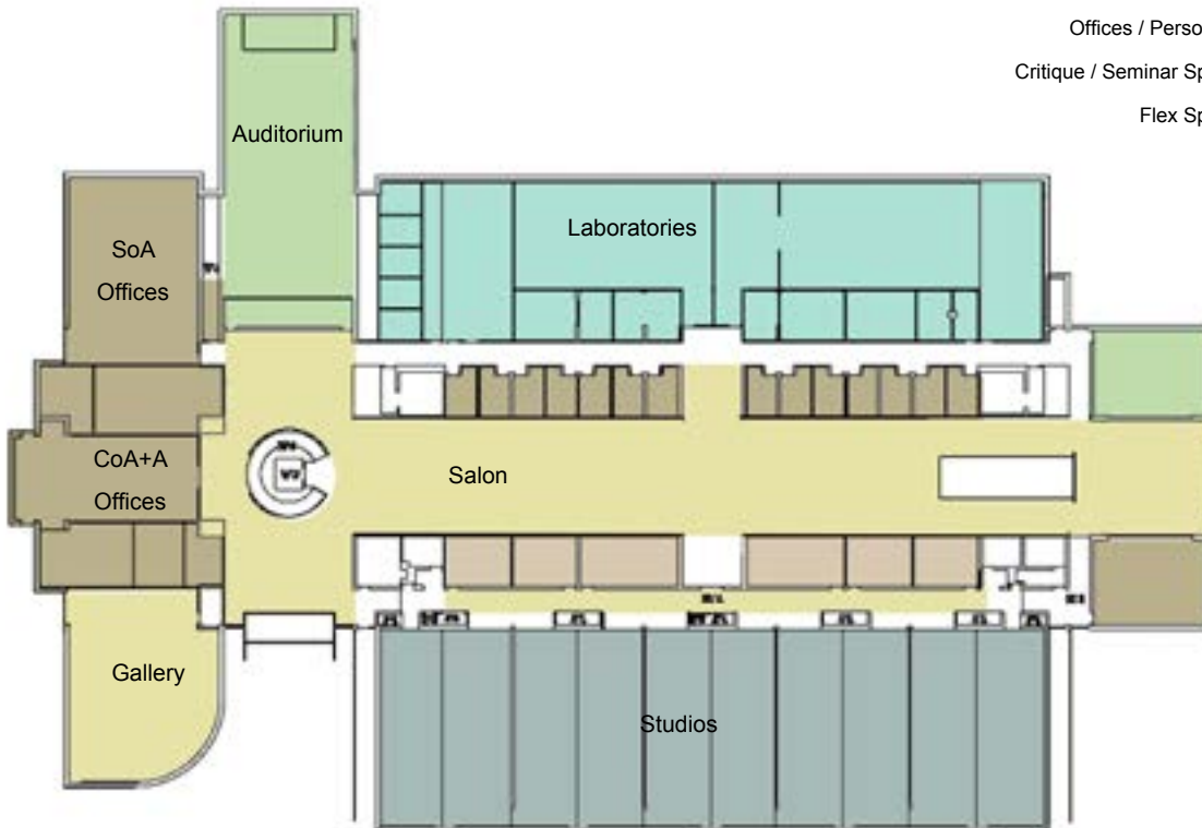
Storrs Hall 1st Floor Plan, N.T.S.